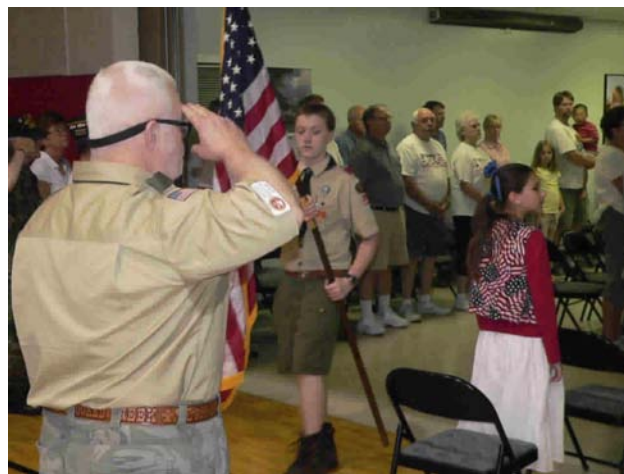
Retiring the colors