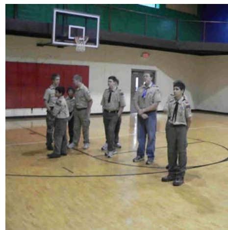
Some of the Scouts