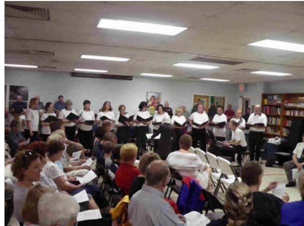
Oldham County Singers