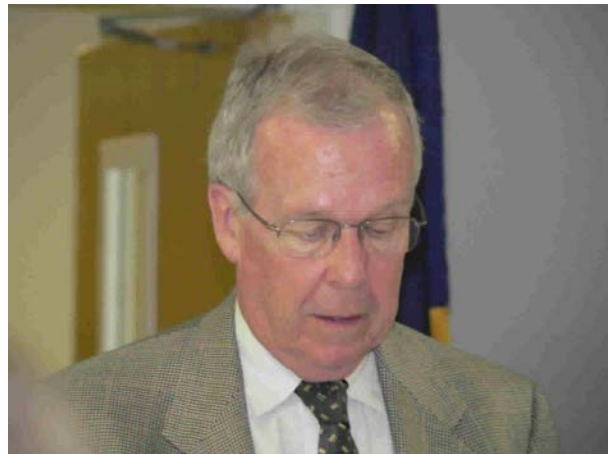
County Judge Duane Murner