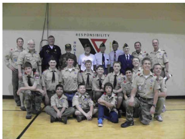
Group photo: find your own person!