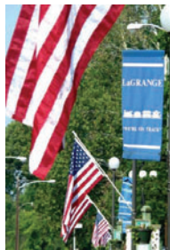
Avenue of Flags in La Grange

Flags are placed on Veterans' graves at all the cemeteries in Oldham County for Memorial Day. Each year Legion members volunteer to place the flags in Oldham County.