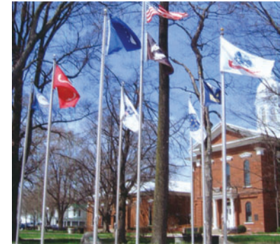
Flags of all the military services fly throughout the year over the Veterans Memorial at the Courthouse Square in La Grange.

Members also get the benefit of satisfaction by recognizing the service of others and helping them and their families remember that service and the freedom it offers to all citizens of the United States of America.