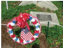
Veterans Memorial Wreath—2008

The Avenue of Flags in La Grange is sponsored by The American Legion with support from the city of La Grange. Flags fly from Memorial Day to Veterans Day.