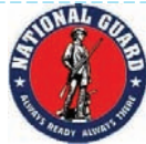
National Guard December 13, 1636