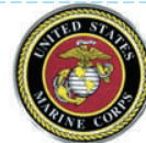
Marines November 10th, 1775